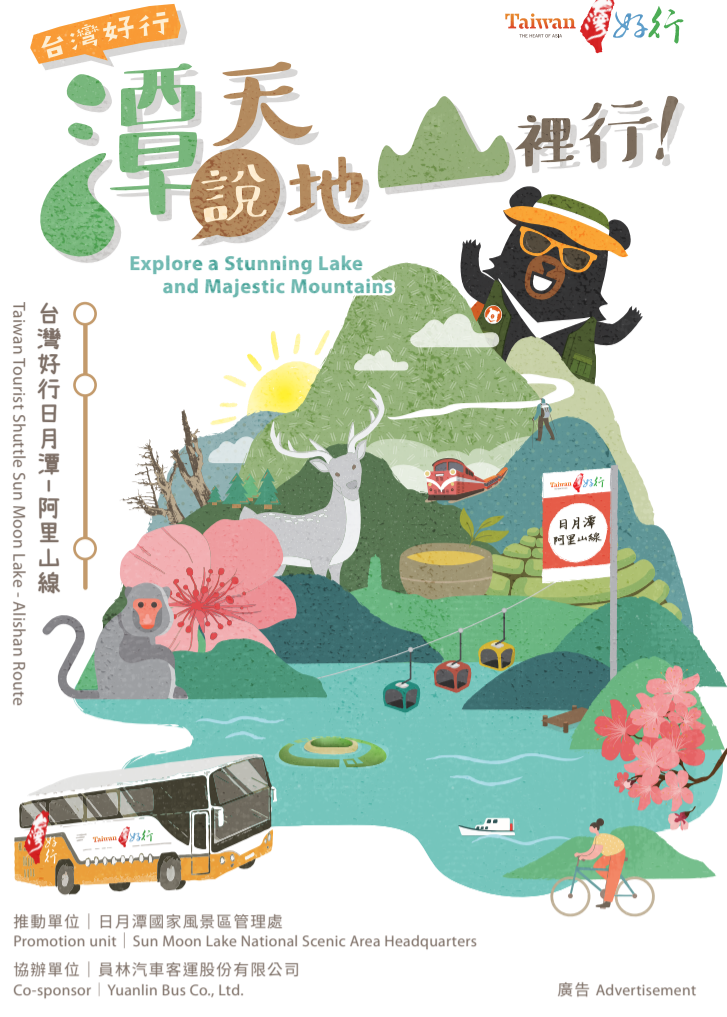
Taiwan Tourist Shuttle Sun Moon Lake - Alishan Route

推動單位 | 日月潭國家風景區管理處 Promotion unit | Sun Moon Lake National Scenic Area Headquarters 協辦單位 | 員林汽車客運股份有限公司 Co-sponsor | Yuanlin Bus Co., Ltd. 廣告 Advertisement